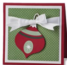
Christmas Ornament Card