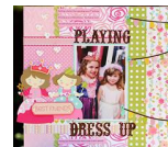
Playing Dress Up