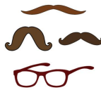
Mustaches & Glasses Digital Set