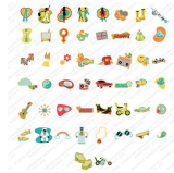
Groovy Times Cartridge