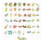
Groovy Times Cartridge