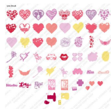
Cricut® Love Struck Seasonal Cartridge