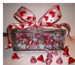
Hugs & Kisses Glass Block