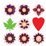
Cricut® Projects Cartridge, Flower Shoppe