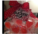
Valentines Sucker Gift Basket