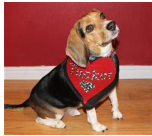
Valentine Doggie Bandana