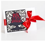
French Cake Card