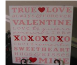
Word Collage Boards