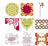
Cricut® Storybook Cartridge