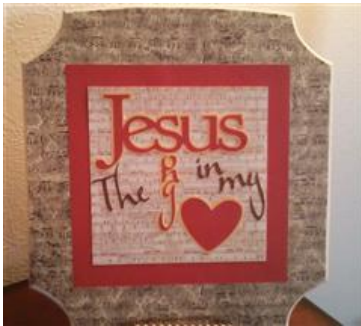
Jesus the song in my heart

Arranged and glued the letters and heart. Placed it on a plate stand a picture hanger could be added to the back and hung from the wall.