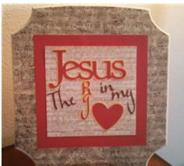
Jesus the song in my heart

Glued background paper to board then centered the red card-stock glued it in place.