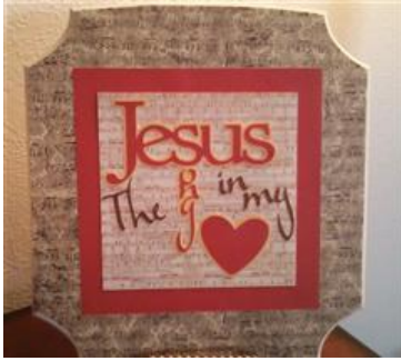
Jesus the song in my heart

Centered 6X6 paper on top of the red card-stock and glued it down.