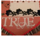
You are my True Love