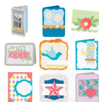
Creative Cards Cartridge