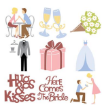
Cricut® Sweethearts Cartridge