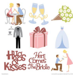
Cricut® Sweethearts Cartridge