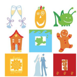
Cricut® Stretch Your Imagination Cartridge