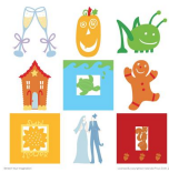
Stretch Your Imagination Cartridge