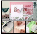
Butterfly Kisses Card