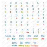
Cricut Font and Basic Shapes Digital Set