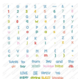
Cricut Font and Basic Shapes Digital Set