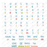
Cricut Font and Basic Shapes Digital Set