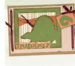
"6 Today" Card