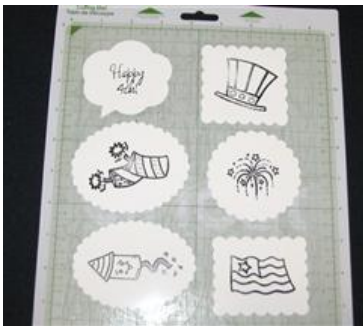
Stamp your images on