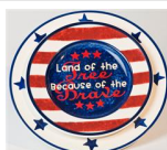
Land of the Free Plate