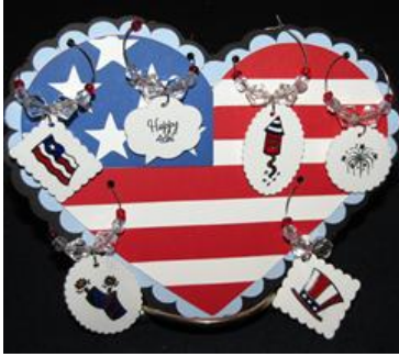
Fourth of July Glass Charms

I started off the project using shrink material in Bright White.