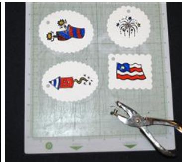
Punch your holes in and bake