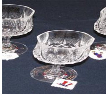
On the glasses