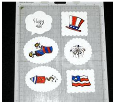
Color the stamped images in