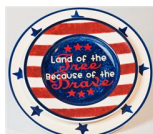
Land of the Free Plate