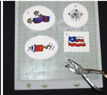
Punch your holes in and bake