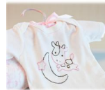
Cricut Mini® - Baby Sleeper