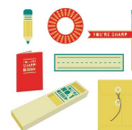
Cricut Mini® School