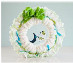
Cricut Mini® - Baby Diaper Wreath