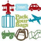
Summer Vacation Cartridge