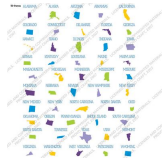
Cricut® 50 States Classmate™ Cartridge