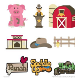
County Fair Cartridge