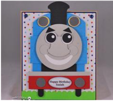
Thomas the Train

I started with inspiration from Pinterest. I cut a cylinder at 3 1/2" using the George cartridge. I also used George to cut Thomas' face at 3". I used lots of punches! Other details can be found on my blog.