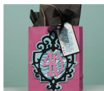
Happy Birthday Gift Bag