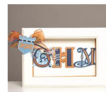
Fontopia Monogram Frame