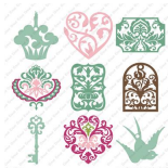
Damask Décor Cartridge