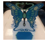
Butterfly Display card