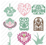
Damask Décor Cartridge