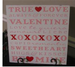
Word Collage Boards