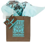
Gate Gift Bag