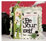
Be Yourself Mini Album