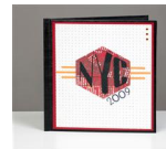
NYC 2009 Mini Album