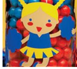
Gum Ball Jar