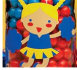
Gum Ball Jar