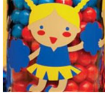
Gum Ball Jar