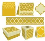
Cricut Mini® Elegant