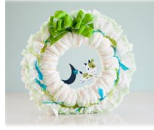
Cricut Mini® - Baby Diaper Wreath