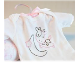
Cricut Mini® - Baby Sleeper