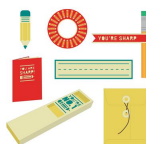
Cricut Mini® School