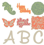
Paper Lace Cartridge