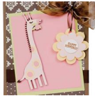
Happy Birthday Card - Giraffe