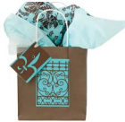
Gate Gift Bag