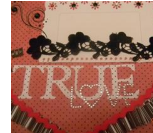
You are my True Love