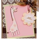
Happy Birthday Card - Giraffe