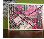
Easy DIY Bulletin Board.