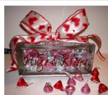
Hugs & Kisses Glass Block