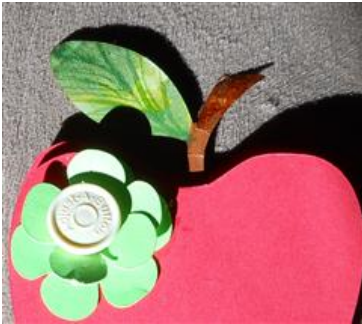
Back to school sewing card

Color the stem and leaf on the ivory card stock front and back, or you can cut more card stock in the color and glue them on. I used my copic markers to color my stem and leaf.