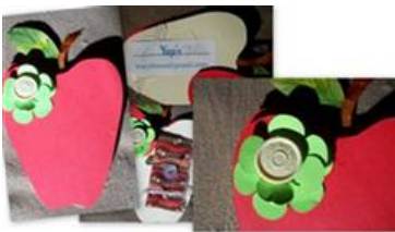
Inside and out

I bought my sewing supplies at the dollar tree, so you can make all of cards with just a couple dollars. Using a 2x2 inch fabric square, I folded it in half, pinned a hand sewing needle to it, a safety pin, and glued a button on. I then glued the fabric to the inside of the card. Using thread I wrapped it around the inside of the card several times, and used masking tape to tape the back of the ivory cardstock to keep the thread in place.