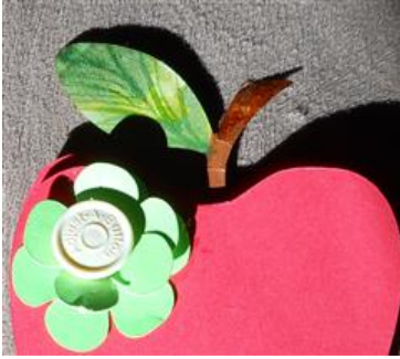
Back to school sewing card

Once all the pieces are cut it is time to assemble the card. Cut out the stem and leaf on the red apples.