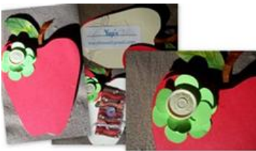
Inside and out

I bought my sewing supplies at the dollar tree, so you can make a lot of cards with just a couple dollars. Using a 2x2 inch fabric square, I folded it in half, pinned a hand sewing needle to it, a safety pin, and glued a button on. I then glued the fabric to the inside of the card. Using thread I wrapped it around the inside of the card several times, and used masking tape to tape the back of the ivory cardstock to keep the thread in place.