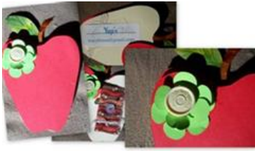
Inside and out

I then took both red cardstock apples and added the front and back to the ivory card. Using an adjustable button as a brad, and my flower shoppe scallop flower to the hole to keep it together. This project was very easy and fast. I made eight in less than half an hour.